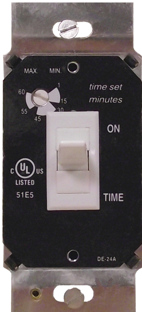
#42517 - White Shown