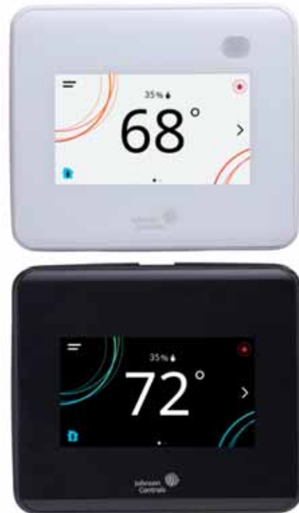
Figure 1: TEC3000 Color Series Thermostat Controller shown with and without occupancy sensor in white and black enclosures

A bright, high-definition capacitive touchscreen display provides responsive feedback and improved readability of text and icons. The home screen is configurable to Modern and Classic, and Light and Dark themes.